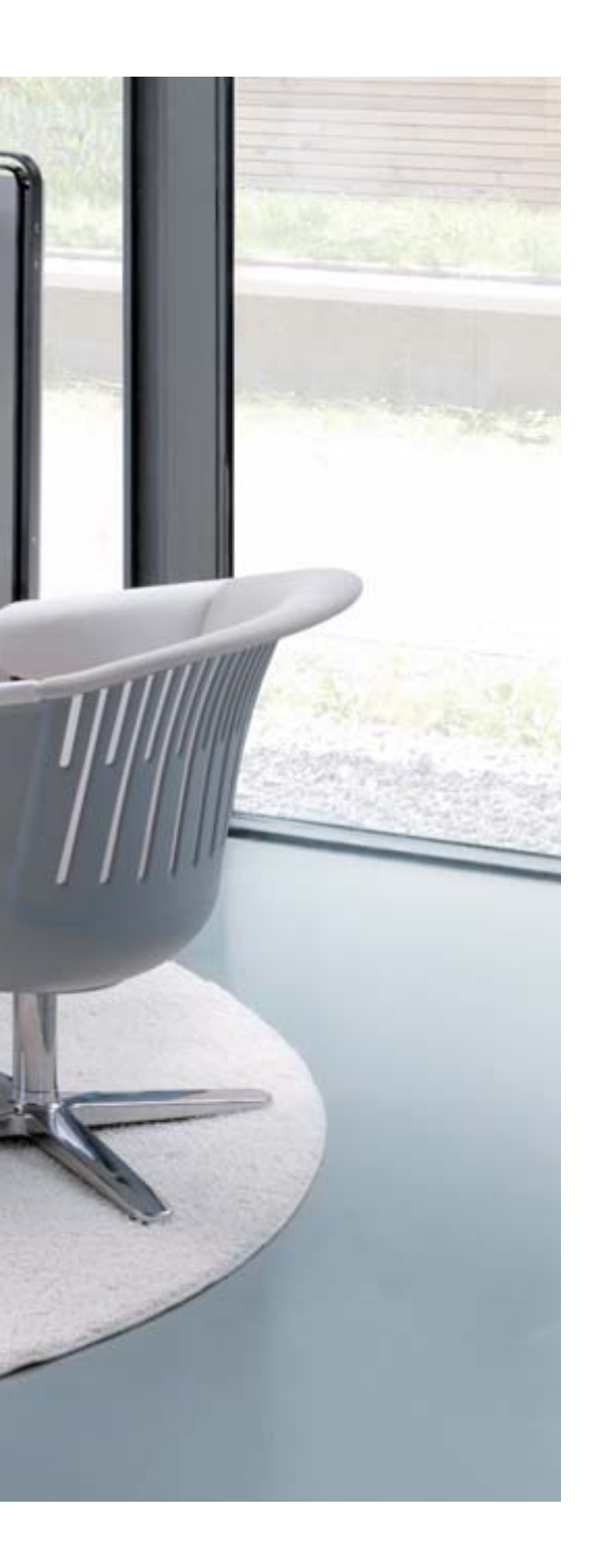
Welcome and in-between area. i2i chair with i2i lounge table .