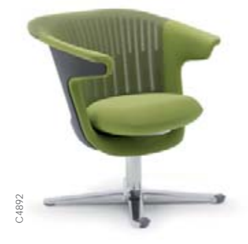
i2i swivel on mobile base with or without automatic return