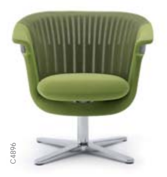
i2i swivel with or without automatic return